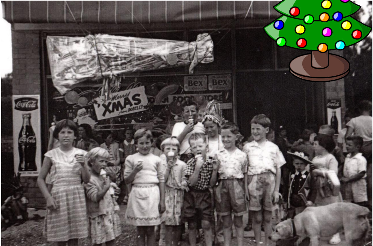
May all your celebrations be filled with family, friends and ice cream - just like these children at the Greenhills Milk Bar (this building is now the Clay Pot in Greenhill Road)