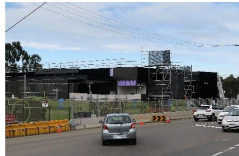
New Greensborough Station under construction, 2023.