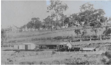
Greensborough Station, 1920s