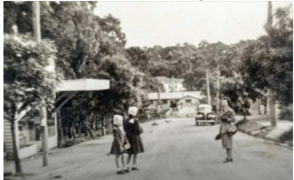
Early view of Were Street Montmorency