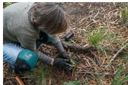
Hands on planting 2019, Image: Chris McCormack, from Remember the Wild

During the Millennial drought the water flow was so low that you could step across parts of the River. It is now flowing strongly and the many plantings are healthy and thriving. Many areas have been transformed, with the change evident, while others have merged into the landscape.