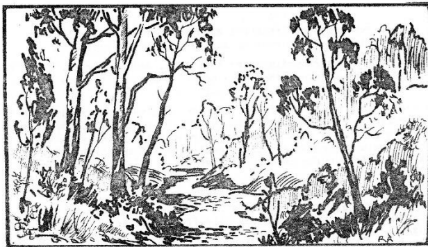
Near Partington's Reserve