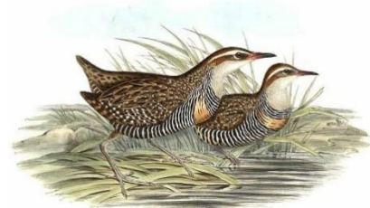
Buff-banded Rail – Lithograph by John Gould

The Friends logo is the Buff-banded Rail. It is a secretive, medium-sized bird with black-and-white barrings on its body and a rich chestnut buff band across the upper breast. It is largely terrestrial and is found in wetlands of all kinds, including along the Plenty River.