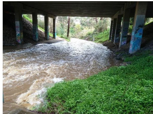
Plenty River in flood, August 2020