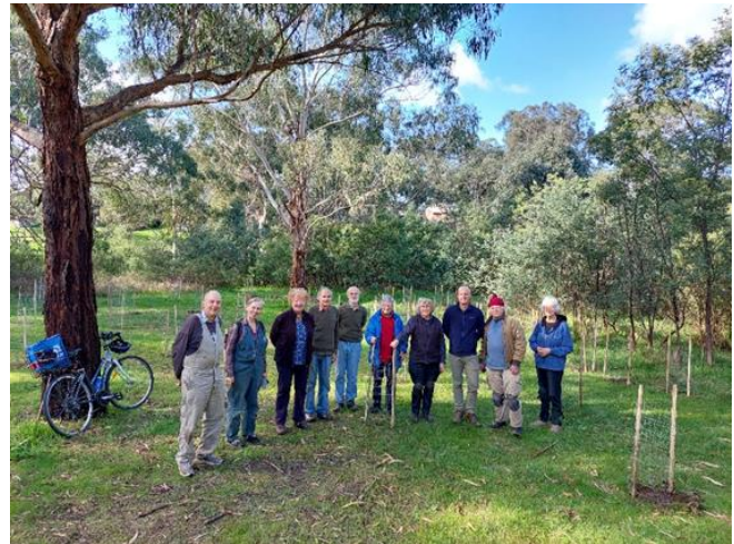
Friends of Plenty River Planting Day at Yallambie, June 2023

The Friends work in close cooperation with Banyule Council Bushland Management Team to identify work areas, prepare sites and conduct the working bees. A Ranger from the Team usually attends working bees, with a truck and tools and also provides plants to put in and wire guards and stakes if necessary.