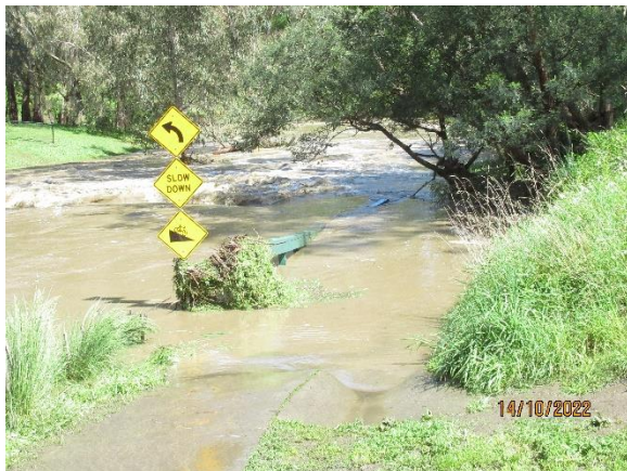
Plenty River near Plenty Lane, October 2022