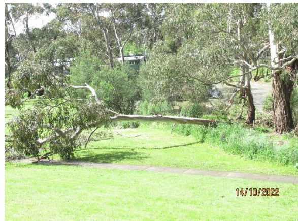
Plenty River near Plenty Lane, October 2022