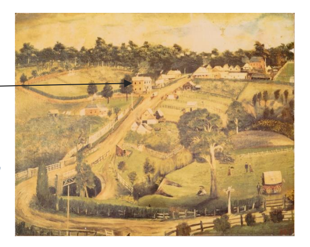
Elliott's 1889 painting of Greensborough shows a prominent Marble Hall

Marble Hall was a landmark in many early photographs of Main Street Greensborough.