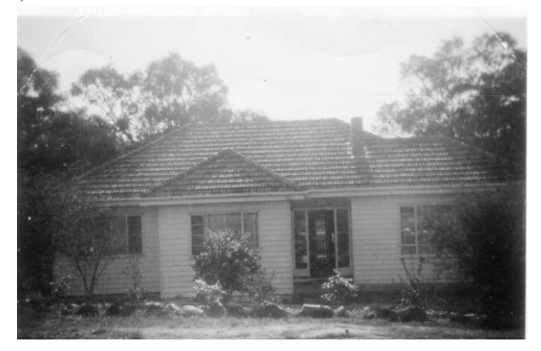
The Mallett family home in Donald Street

Greensborough. The classes began with around 6 mums, and ended with around 40 mums 2 years later.