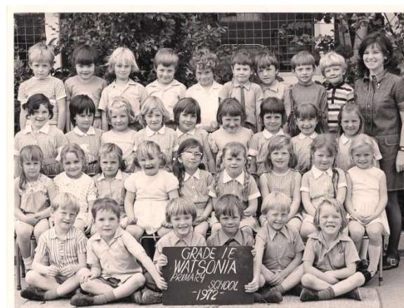
Grade 1E 1972