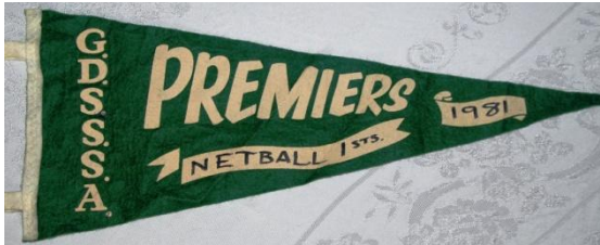
Netball Premiers 1981