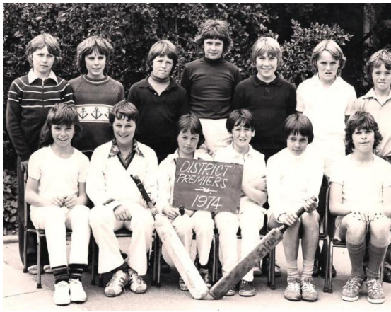
District Premiers: Cricket 1974