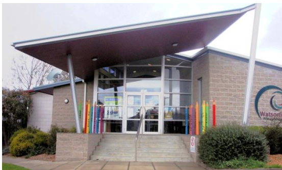
The welcoming entrance

And finally Watsonia Primary school today: