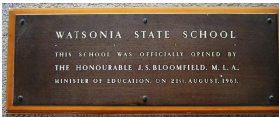
Official opening of Watsonia Primary School 1961