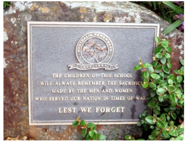
A tribute to our war veterans.